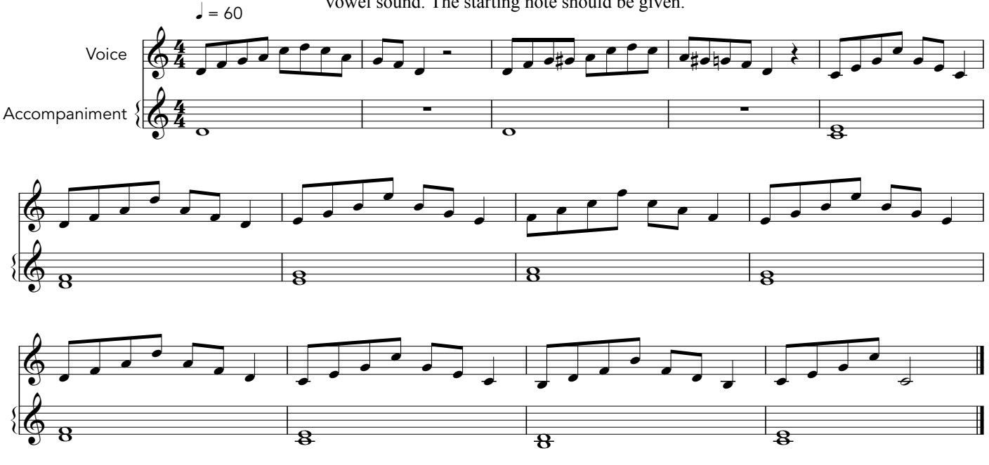
Exercise 2 - Rhythm Skills

Sing the following with the accompaniment using any suitable syllable or vowel sound. The starting note should be given.