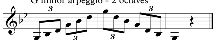
G minor arpeggio - 2 octaves