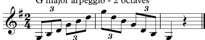
G major arpeggio - 2 octaves