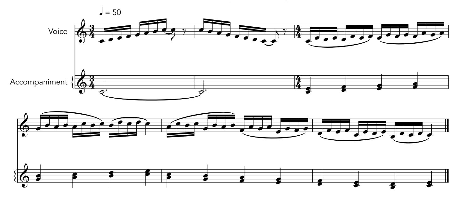
Exercise 2 - Rhythm Skills

Sing the following with the accompaniment using any suitable syllable or vowel sound. The starting note should be given.