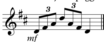
D major arpeggio