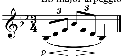
Bb major arpeggio