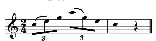
C major arpeggio